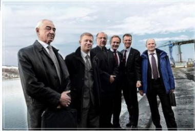
The opening ceremony of the Information Office took place in April 2011 in Kirkenes, Norway.

The NSR Information Office is owned and operated by the Centre for High North Logistics (CHNL). The office was established as a joint initiative in April 2011 between CHNL and Rosatomflot, with additional financial support coming from Norwegian Barents Secretariat. Main office is located in Kirkenes, Northern Norway with branch office in Murmansk, Russia.