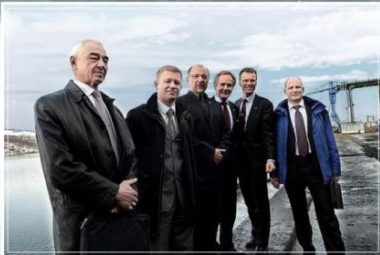
The opening ceremony of the Information Office took place in April 2011 in Kirkenes, Norway.

The NSR Information Office is owned and operated by the Centre for High North Logistics (CHNL). The office was established as a joint initiative in April 2011 between CHNL and Rosatomflot, with additional financial support coming from Norwegian Barents Secretariat. Main office is located in Kirkenes, Northern Norway with branch office in Murmansk, Russia.